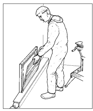
Use non-asbestos boarding to protect asbestos