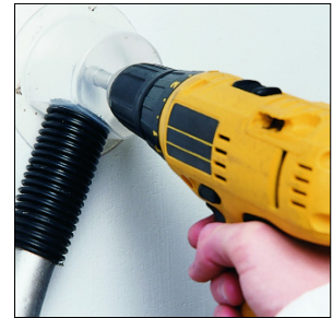
Control measures: shadow vacuuming and using plastic enclosures as local extraction