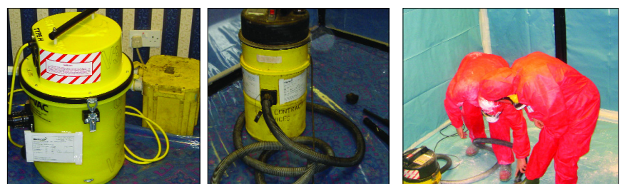
Hire a Class H vacuum cleaner from a licensed hire company and follow all instructions

Caution: Avoid using brush attachments for area cleaning. Brushes are difficult to clean properly.